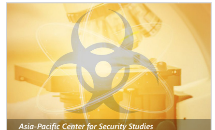
Asia-Pacific Center for Security Studies

A Biodefense Fusion Center to Improve Disease Surveillance and Early Warnings to Enhance National Security